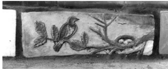
The Garvanza-San Pascual staircase was recognized by the HPHT in 2002 for its artistic tile that was done by local children as an art project.

Taking a short drive around your neighborhood might net some surprises and you may come up with not only one, but two or even more nominations.