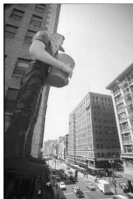
Chicken Boy on Broadway, 1970s.

He became my touchstone. I would drive by in the middle of the night and wave to him. I'd take out of towners to go wave. He was not just a marker for a fried chicken joint, he was a beacon of peaceful dignity intent on finding the silver lining of life. In time, I discovered I wasn't the only one who saw this in his being.