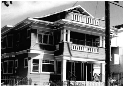
H. J. Moline Flats on Monte Vista St. received a 2004 HPHT award for a façade and restoration.

So put on your nominating hat and go looking.