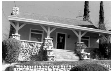
This Craftsman cottage on Holland was awarded by the HPHT in 2002 for sustained maintenance.

Has your neighborhood barber, grocer or hardware store done something to their property that displays community pride? Has a new building in your neighborhood been constructed so as to be sensitive to the architectural integrity of the area? Don't forget the property that is consistently maintained in