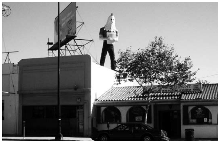
Chicken Boy on Figueroa Street, October 18 2007, 3 pm.